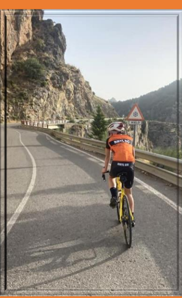
We love seeing our riders wearing their jerseys on their adventurers!